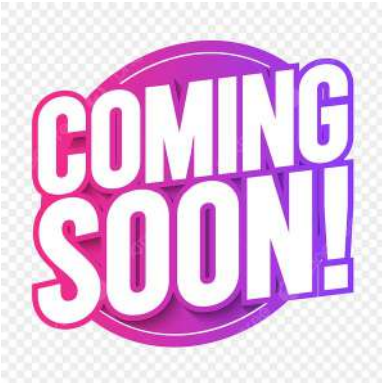
Coming Soon Director of Health Services