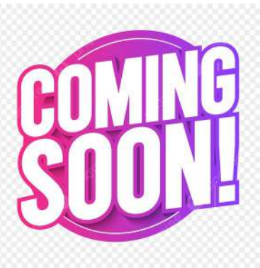
Coming Soon Maintenance Director