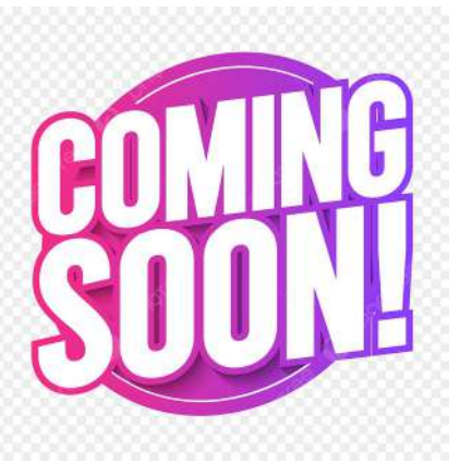
Coming Soon Director of Health Services